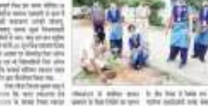
स्काउट गाइड टीम ने थाना परिसर में किया पौधरोपण।