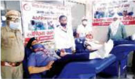
रक्तदान कर रहे भारत स्काउट एंड गाइड के स्वयंसेवक।