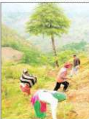
रुद्रप्रयाग : विश्व पर्यावरण दिवस के अवसर पर पौधरोपण करते प्रामीण।